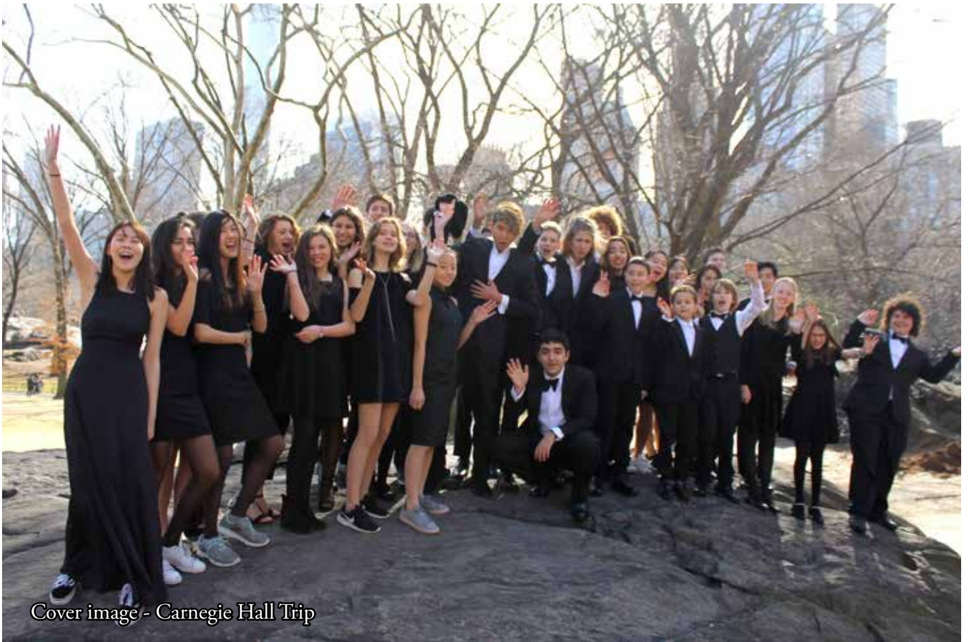
Cover image - Carnegie Hall Trip