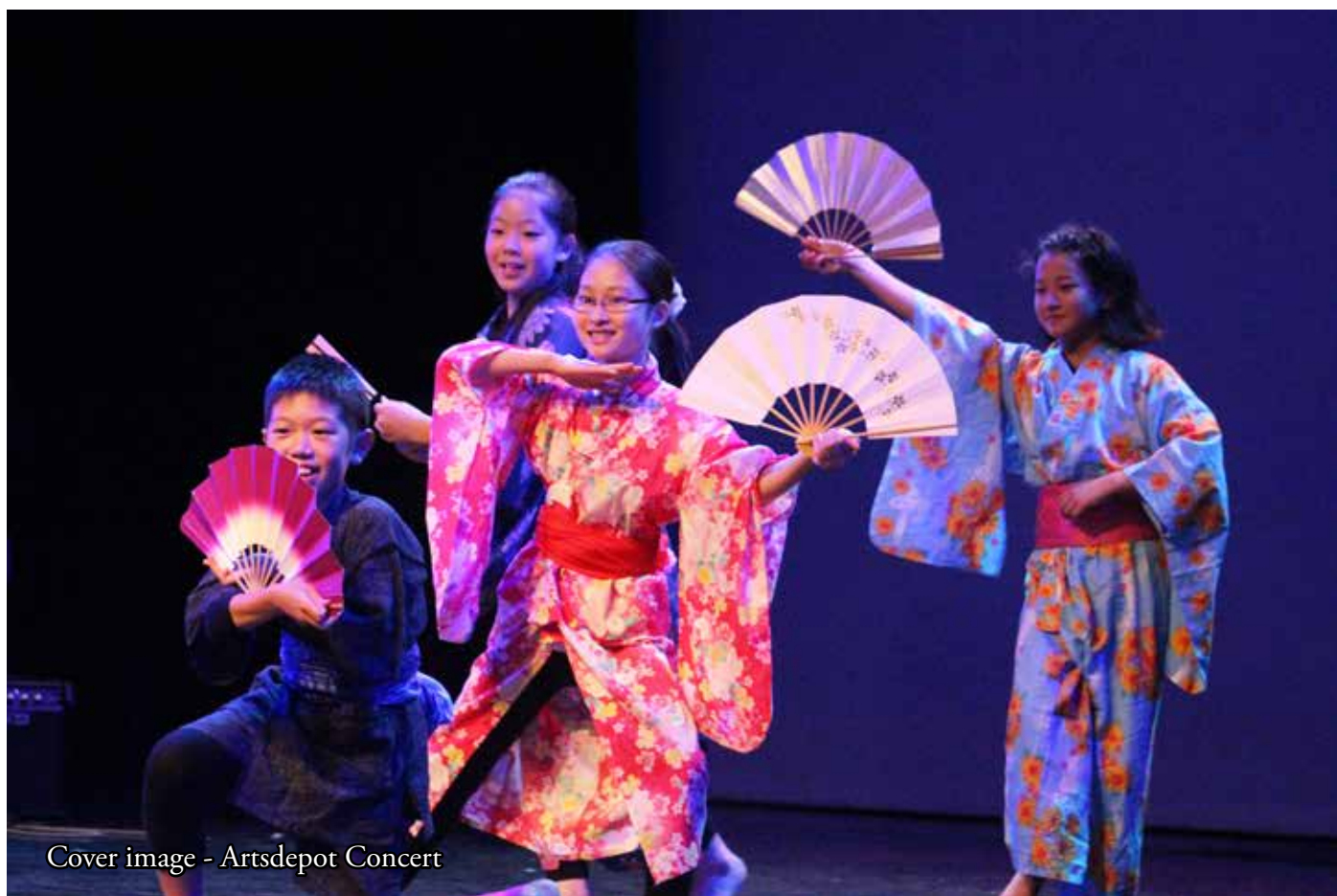
Cover image - Artsdepot Concert